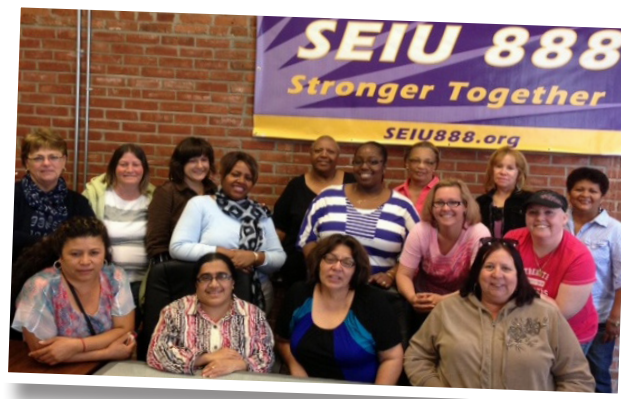
Local 888 members at Somerville's Community Action Agency recently negotiated a new contract.

Amherst Housing Authority Andover Cafeteria and Custodians Blue Hills Custodians, Cafeteria, and Clericals City of Boston (BCYF, BPD, DND, City Hall and Elderly Commission) Boston Public Health Commission Clerks and Techs Brewster Ladies Library Brockton Housing Authority Maintenance and Clericals Brockton Library Cohasset Clerical Community Action Agency of Somerville (CAAS) Town of Dennis Everett Custodians Fitchburg Cafeteria Framingham Professionals Hopkinton Paraprofessionals (first contract!) Lawrence Library Lawrence Housing Clericals Lawrence Valley Works Career Center Lexington School Custodians Lowell School Clerks Lowell Library Aides Lowell Tech Custodians Malden School Custodians and Cafeteria Marlboro DPW Foremen Medford Cafeteria